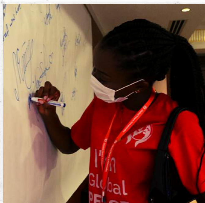
0110G483544 Signing of Peace Petition